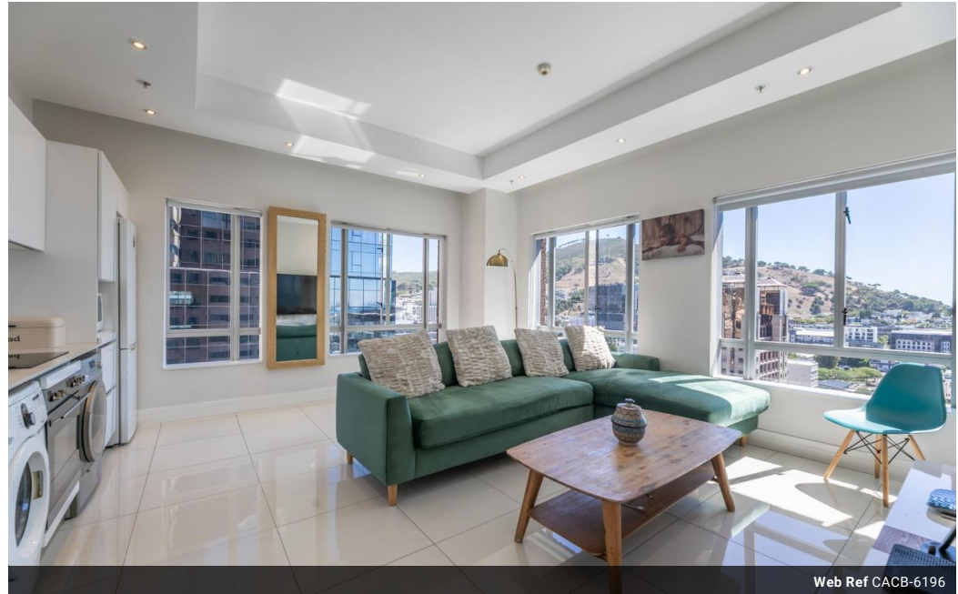
Web Ref CACB-6196

106 Old Cape Quarter Building, 72 Waterkant Street, De Waterkant, Cape Town 8001