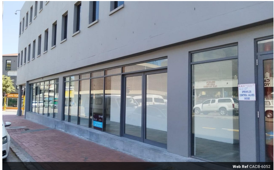
Web Ref CACB-6052

106 Old Cape Quarter Building, 72 Waterkant Street, De Waterkant, Cape Town 8001