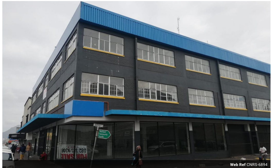
Web Ref CNRS-6894

106 Old Cape Quarter Building, 72 Waterkant Street, De Waterkant, Cape Town 8001