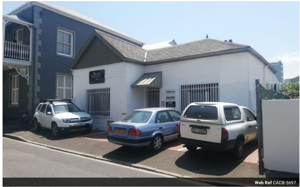
Web Ref CACB-5697

106 Old Cape Quarter Building, 72 Waterkant Street, De Waterkant, Cape Town 8001